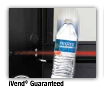
Delivery System Keeps customers satisfied and reduces service calls for misloaded product.