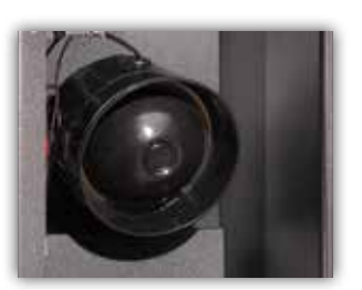
Alarm Feature Sounds when machine is tipped or door opened without authorization.