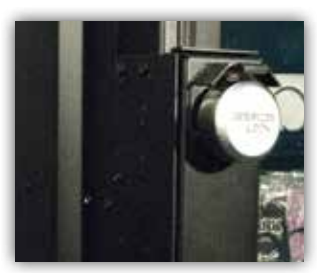
New upgraded lock & hasp We provide the lock you want to secure your outdoor machine's products.