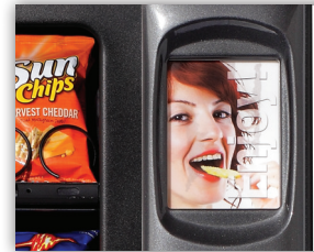
Back lighted point of sale window for advertising and specials.