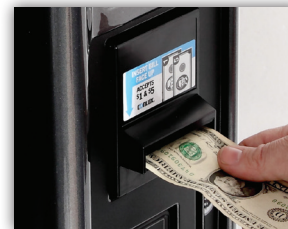
Premium Currency Acceptors

Enhances product presentation promoting more sales. No bulb servicing for 5 years. Energy efficient and eco-friendly.