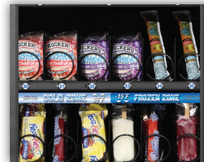
Vends all types of refrigerated & frozen meals, sandwiches & deserts.