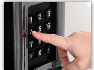
Large Keypad with Braille Identified Keys

Includes standard electronic coin acceptor and $1, $5, $10 & $20 bill acceptor (Set for $1 & $5)