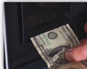
Premium Currency Acceptors

Enhances product presentation promoting more sales. No bulb servicing for 5 years. Energy efficient and eco-friendly.