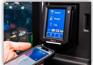
Credit/Debit & mobile reader options.