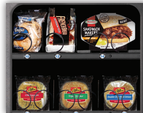
Vends all types of frozen meals, sandwiches & desserts.