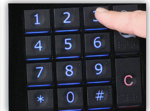
Large Keypad with Braille Identified Keys

Includes standard electronic coin acceptor and $1, $5, $10 & $20 bill acceptor (Set for $1 & $5)